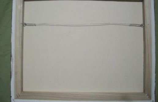
Knot guide for picture wire